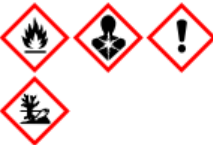
Figure 1 - Label printable from ChemAlert