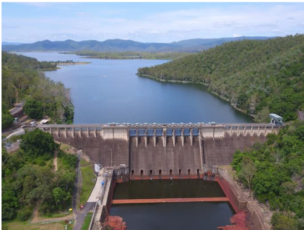
Aerial view of Somerset Dam

Seqwater established a Community Reference Group (CRG) for the Somerset Dam Upgrade in February 2020. The community representatives will continue to work collaboratively with Seqwater to develop and implement a Social Impact Management Plan for the project. You can provide feedback to the CRG through the project webpage.