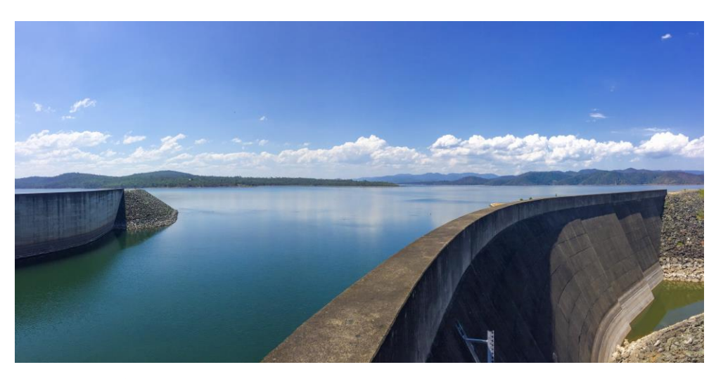
Figure 4: Somerset Dam downstream of dam wall