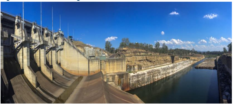
Figure 3: Wivenhoe Dam gates