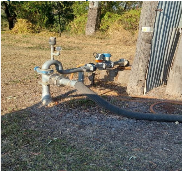
Figure 5: Meter Telemetry

Installation of the telemetry on the customer meters has been completed and the interface (customer dashboard) will go live before the end of 2023.