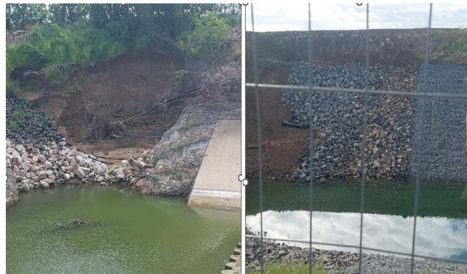
Figure 3: Clarendon Weir flood damage and repairs almost completed.

Central Lockyer storages have been slowly dropping due to a lack of significant rainfall and Seqwater making releases to supplement weir recharges. Flood recovery works from the 2022 floods are progressing. Works to Jordan’s Weir 1 and 2 are 95% completed whilst works to Clarendon Weir are 90% completed. Other projects including meter telemetry and observation bore upgrades have been completed in the field. The operational team continued to focus on ongoing maintenance of the scheme including Dam Surveillance activities, continued maintenance and upkeep of channels, and weed mitigation programs across all areas.