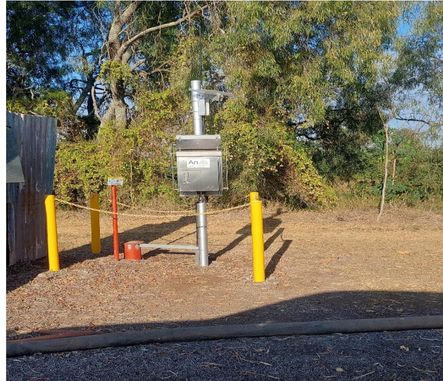
Figure 6: Example of the monitoring equipment installed on the groundwater observation bores.