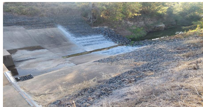
Figure 4: Jordan’s 2 Weir repairs.