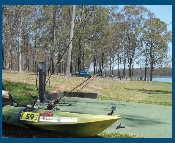
Reviewed July 2020