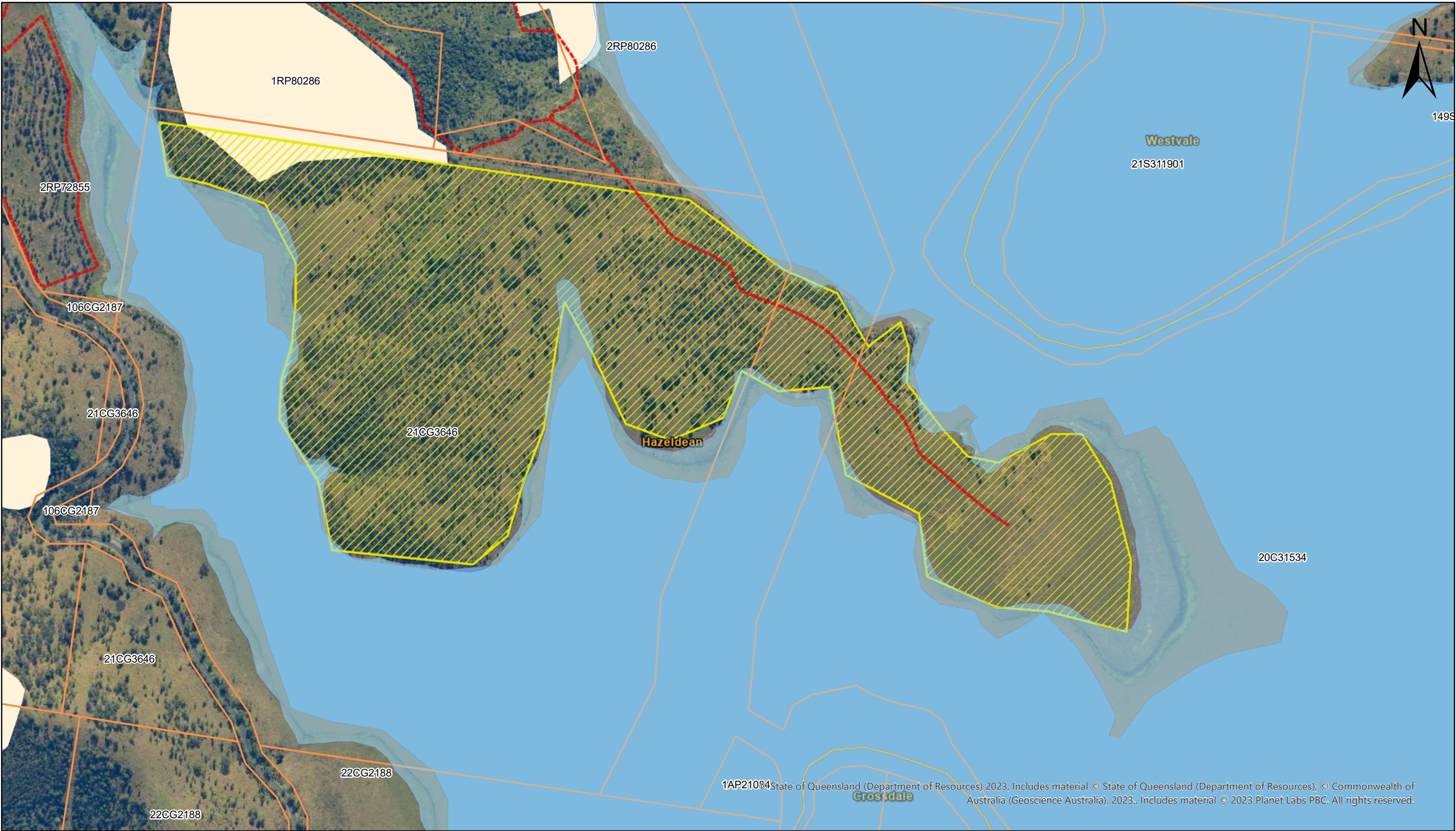
Seqwater Planned Burn DSO011 2023 Map