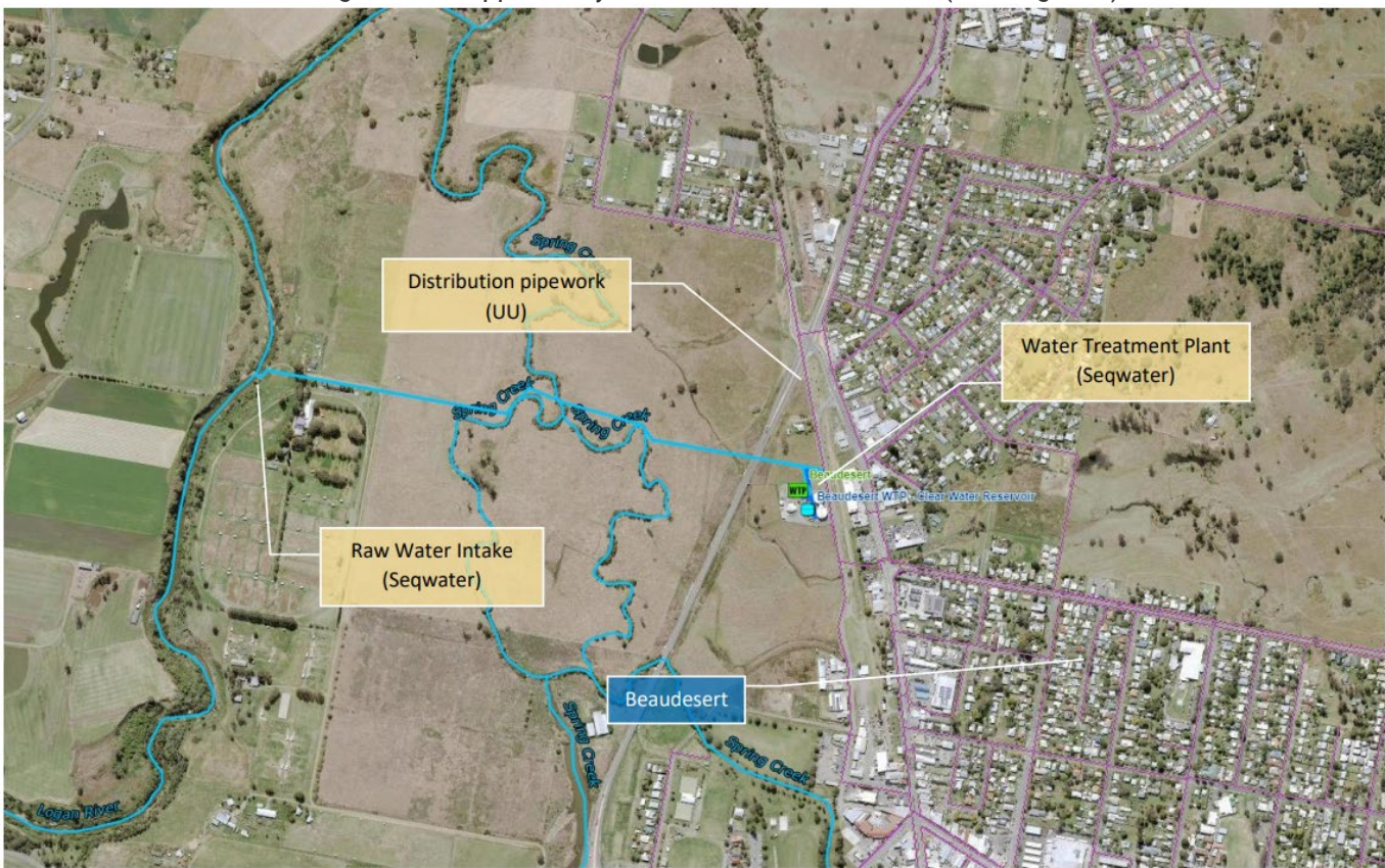
Figure 1 Beaudesert Water Supply Overview

Beaudesert is located within the Scenic Rim Regional Council (SRRC) local government area. The primary water source for the town is the Logan River supported by releases from Maroon Dam (refer Figure 1).